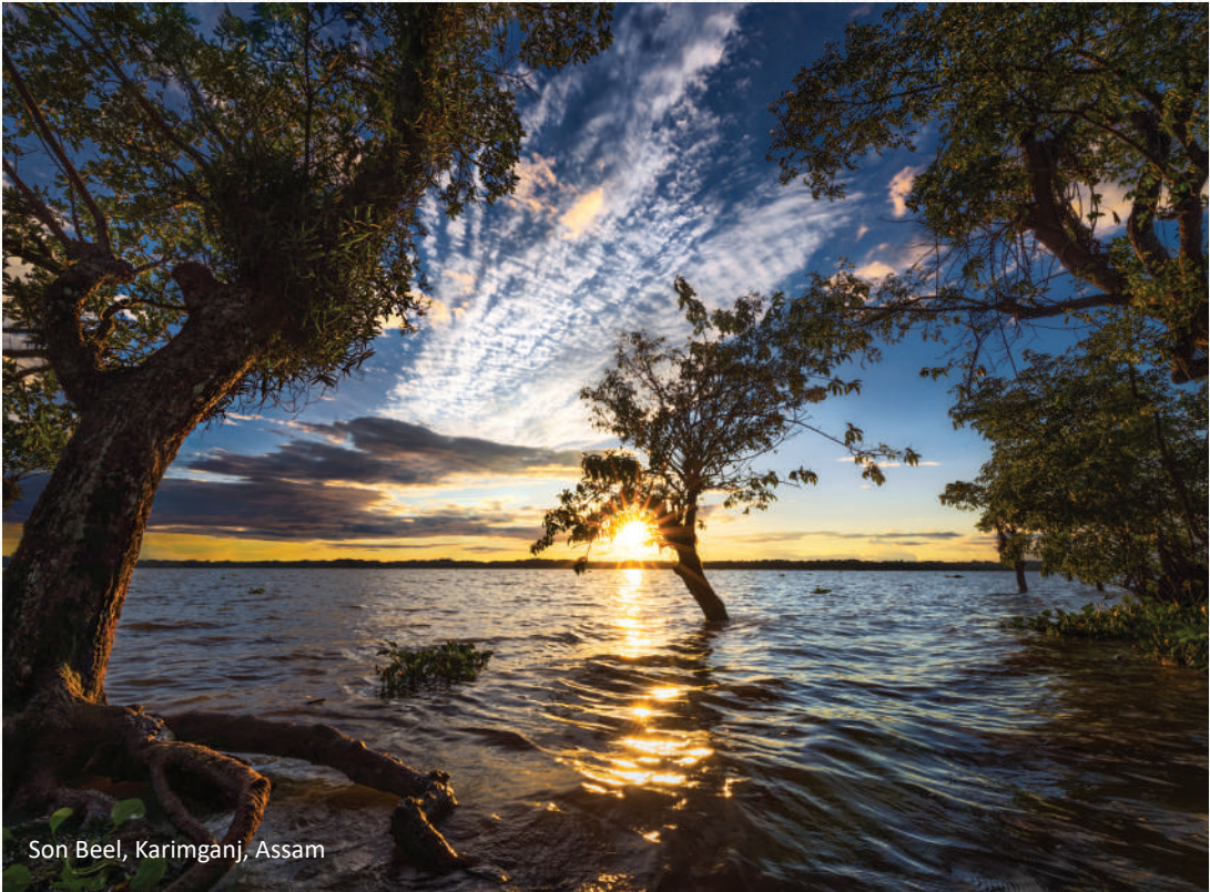
Son Beel, Karimganj, Assam