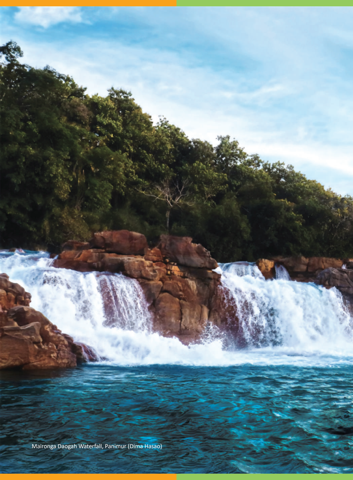
Maironga Daogah Waterfall, Panimur (Dima Hasao)