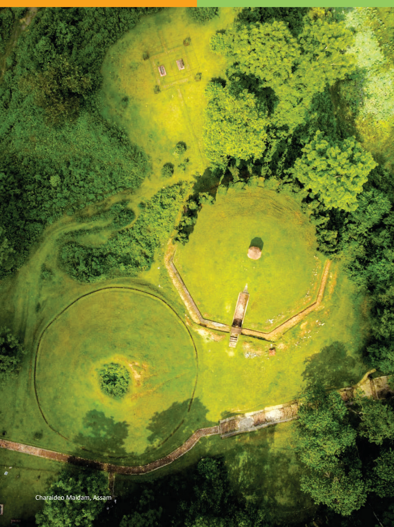
Charaideo Maidam, Assam