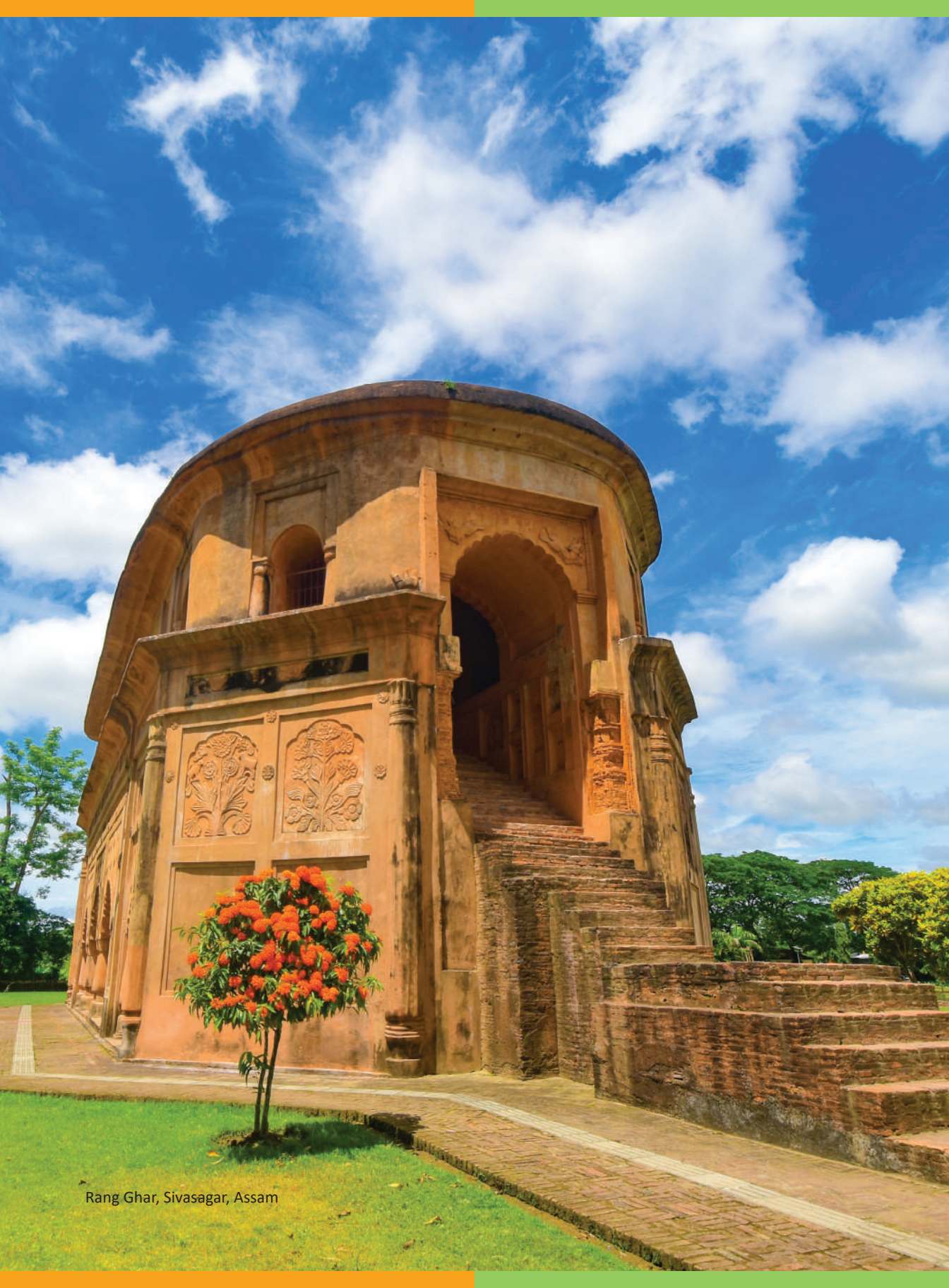
Rang Ghar, Sivasagar, Assam