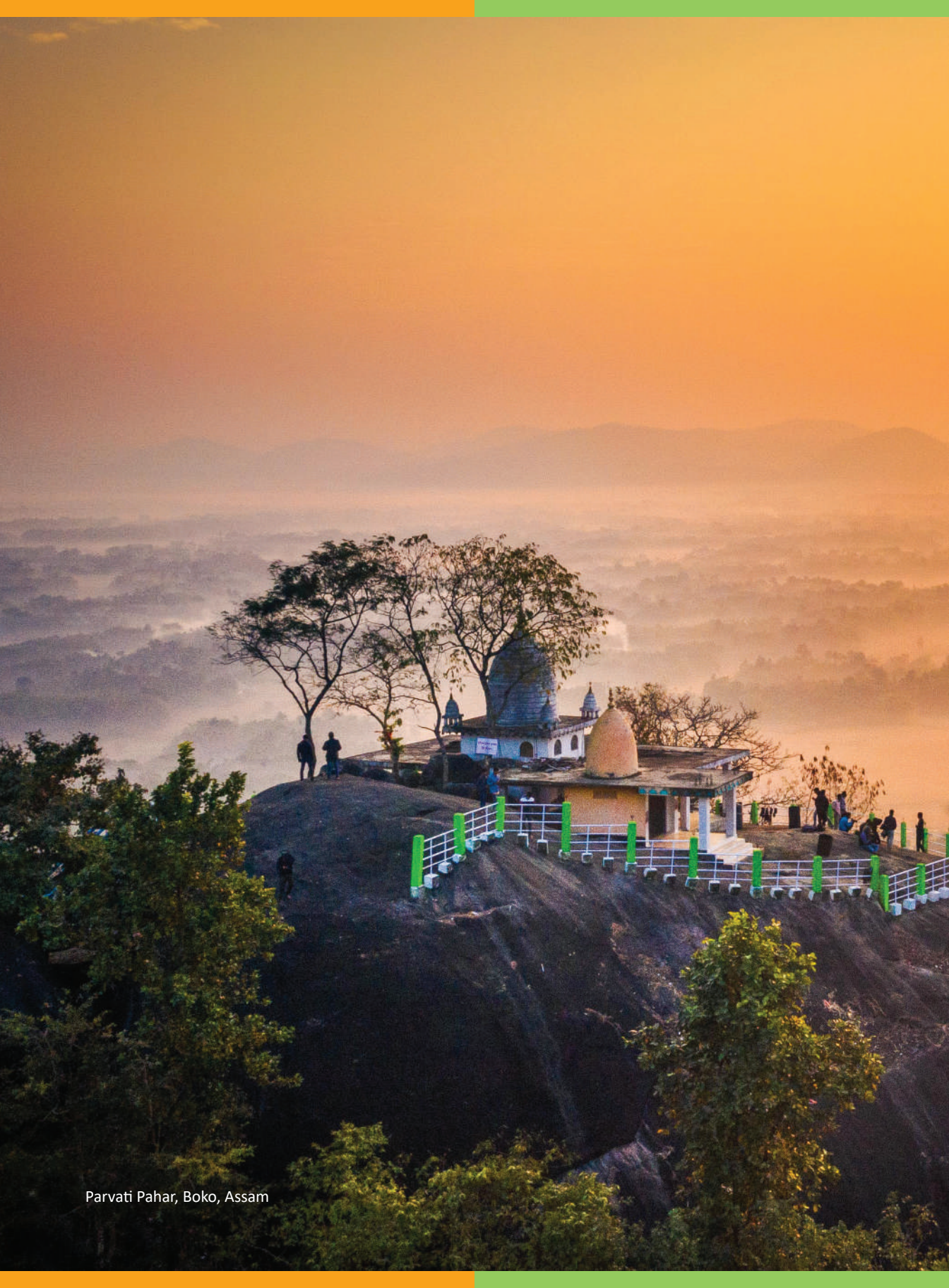
Parvati Pahar, Boko, Assam