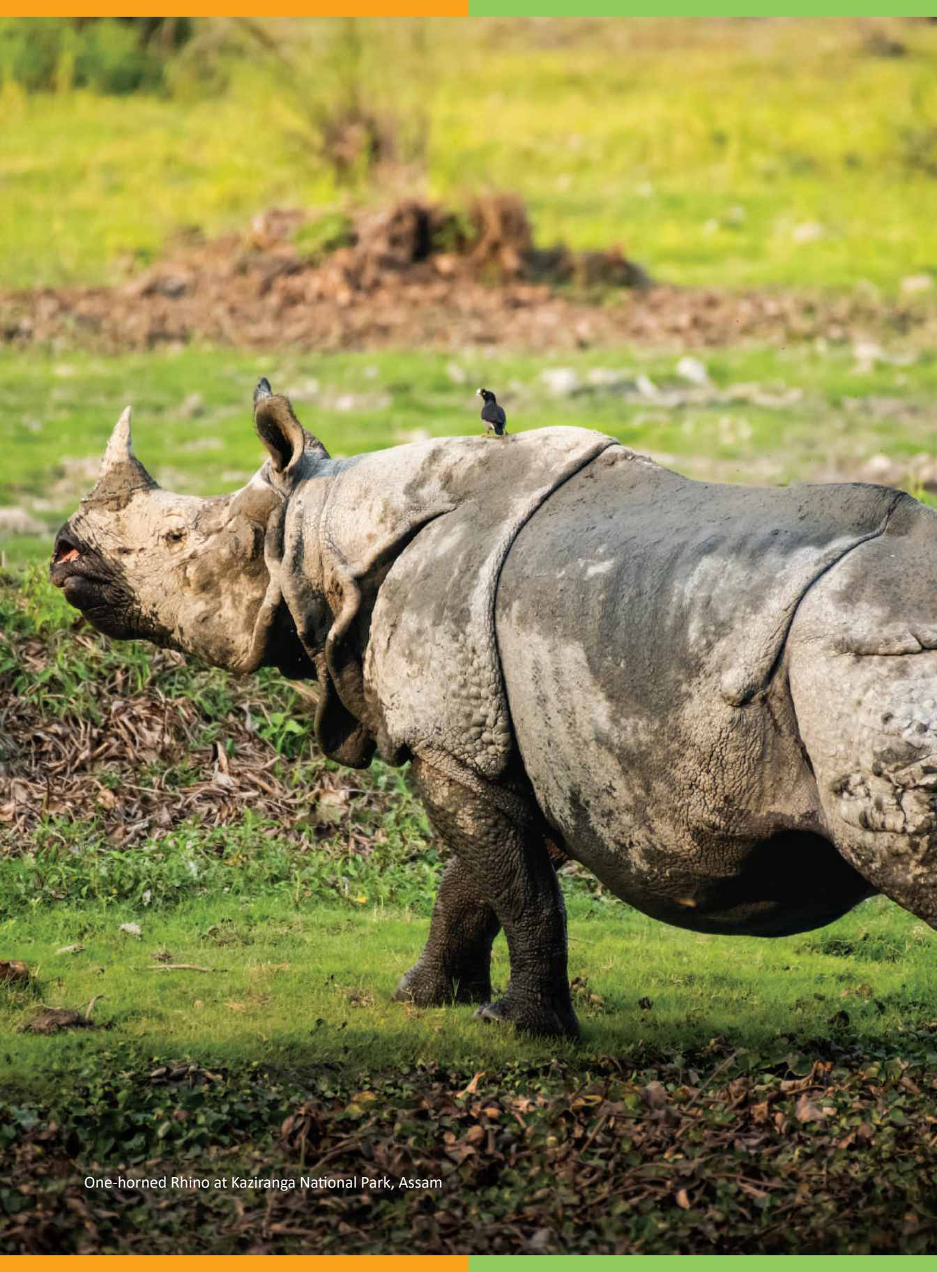
One-horned Rhino at Kaziranga National Park, Assam