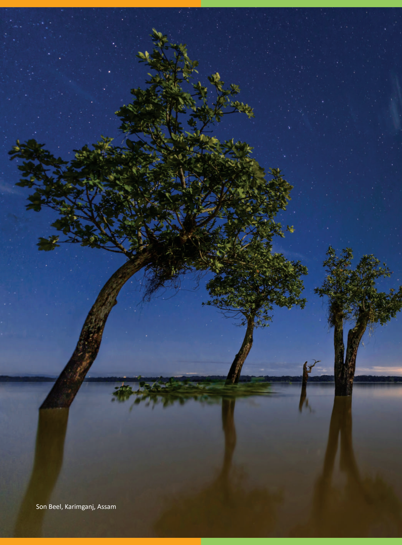
Son Beel, Karimganj, Assam