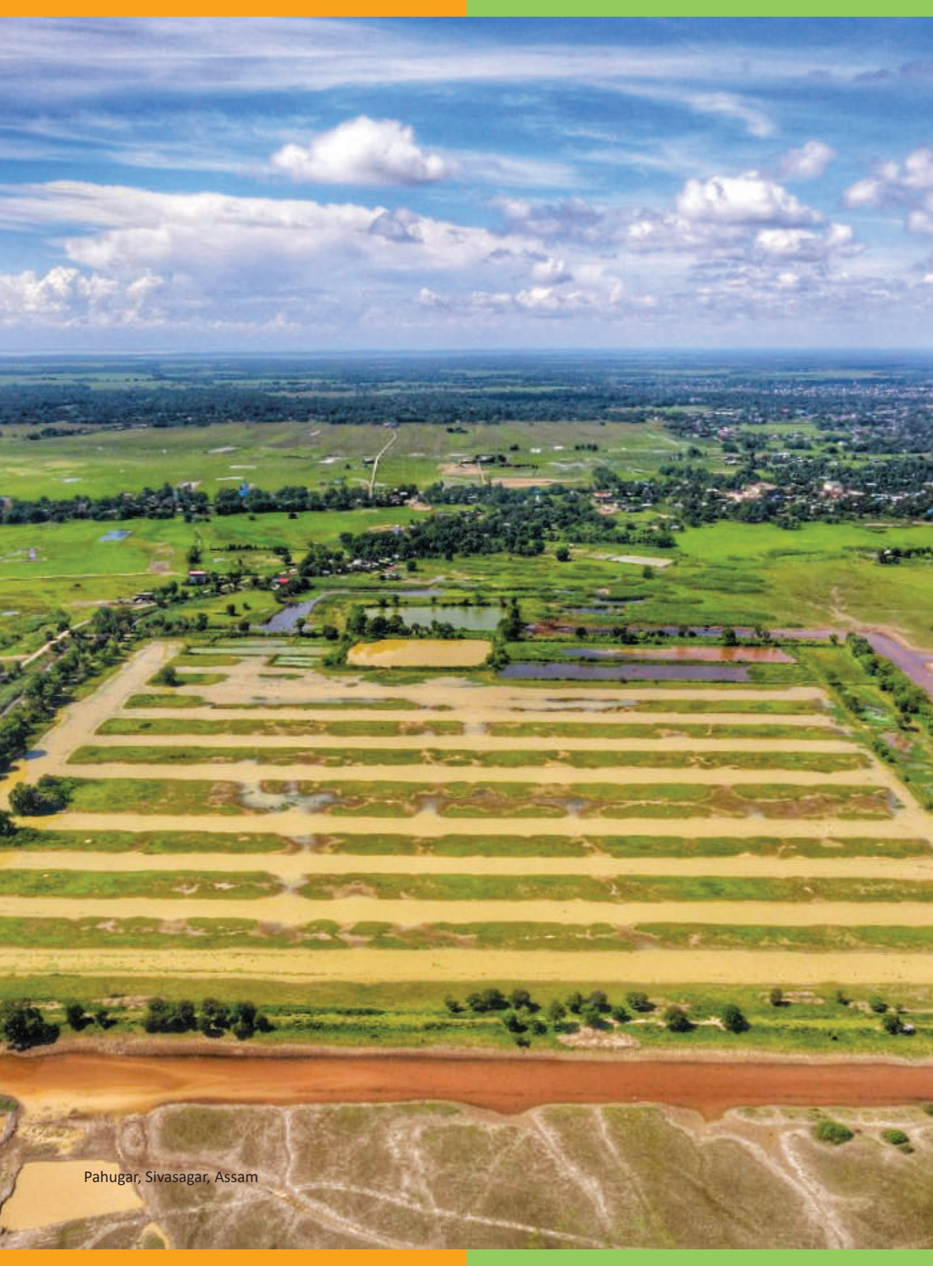
Pahugar, Sivasagar, Assam