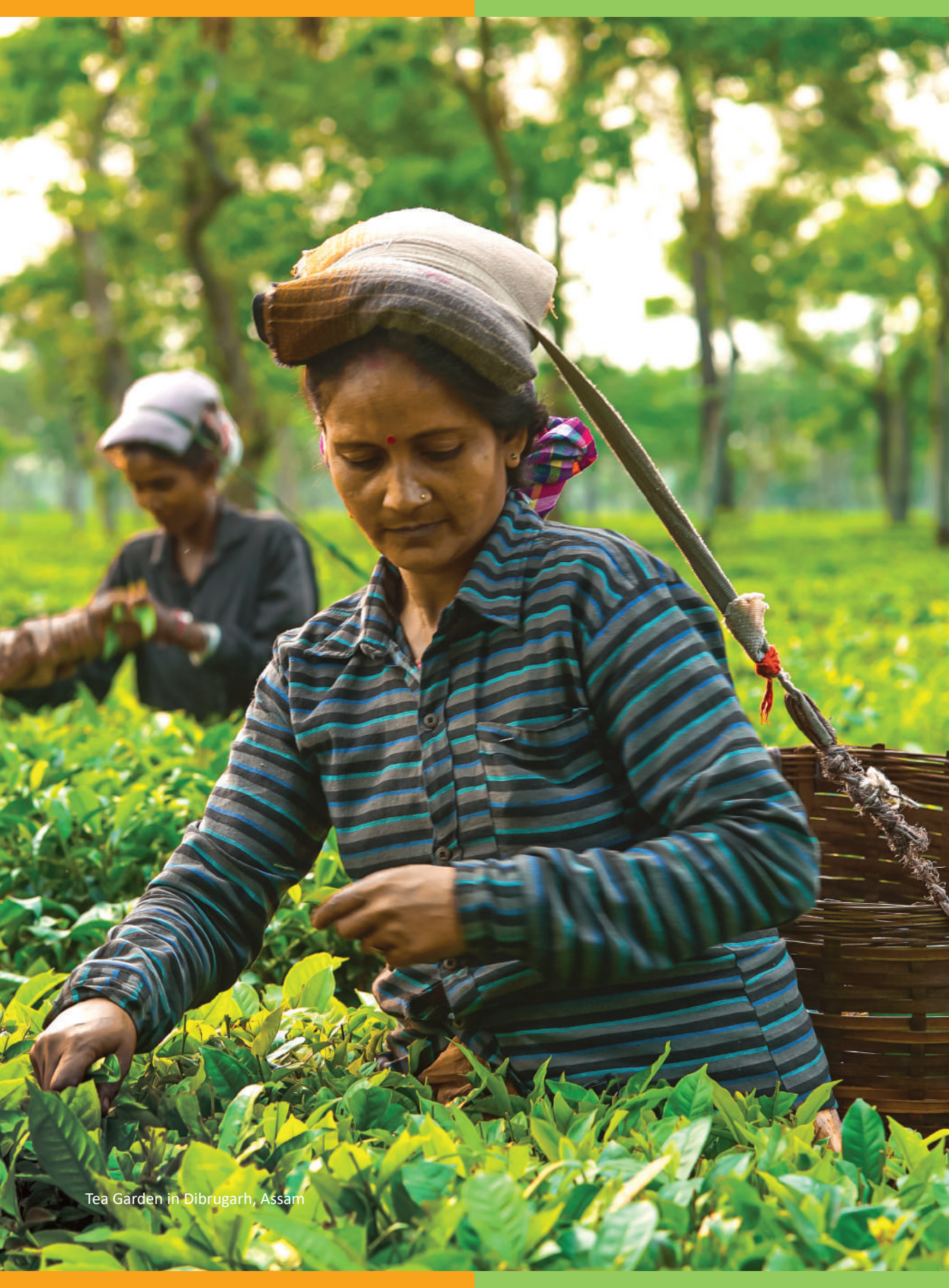
Tea Garden in Dibrugarh, Assam