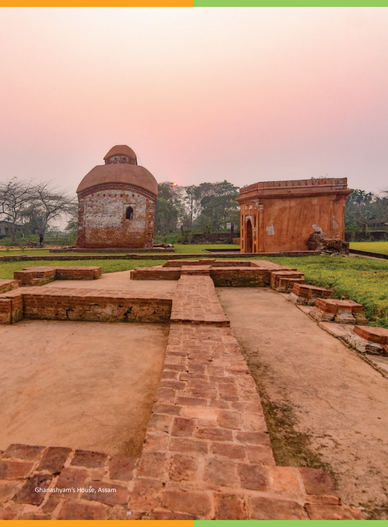
Ghanashyam's House, Assam