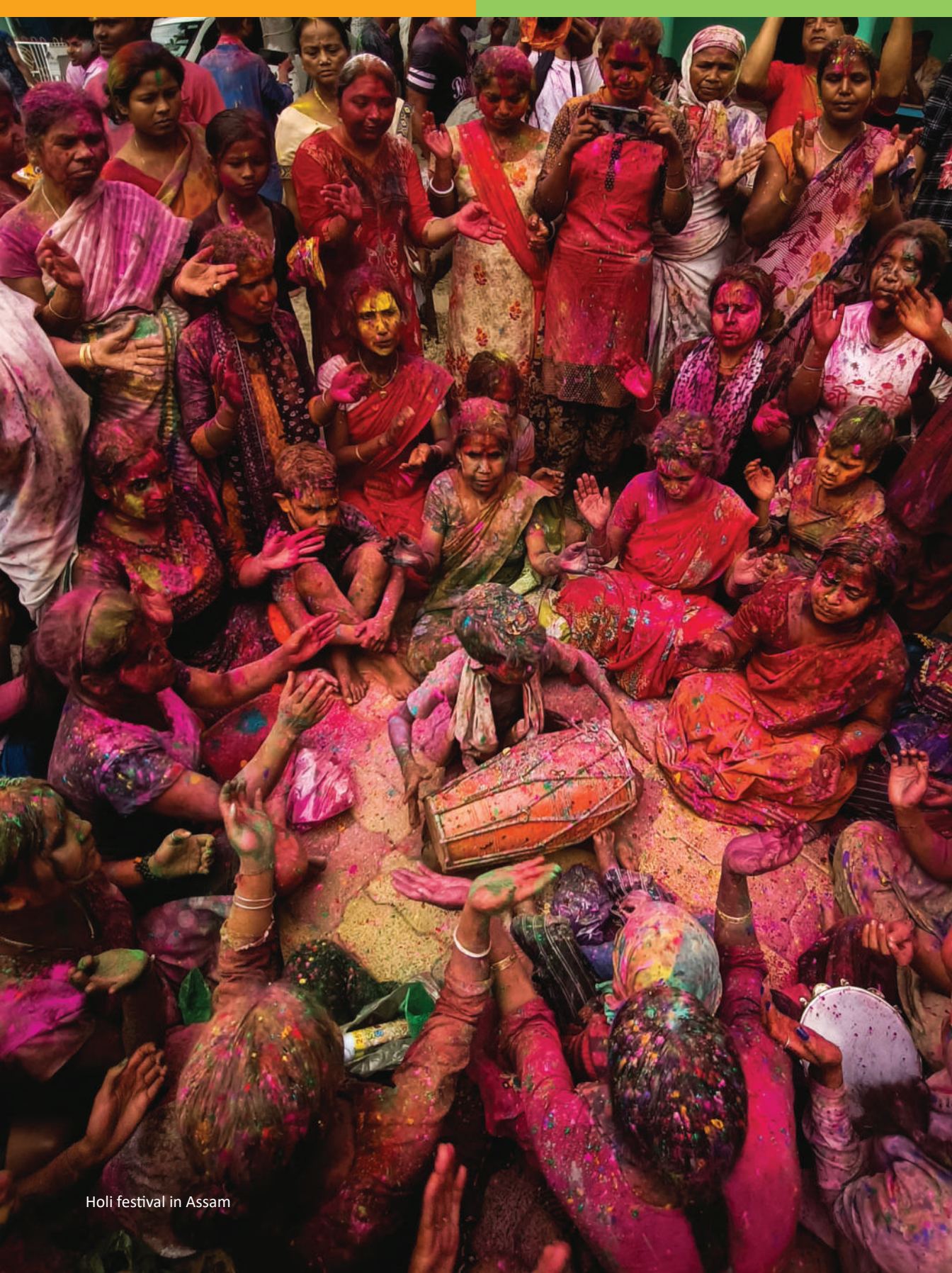
Holi festival in Assam