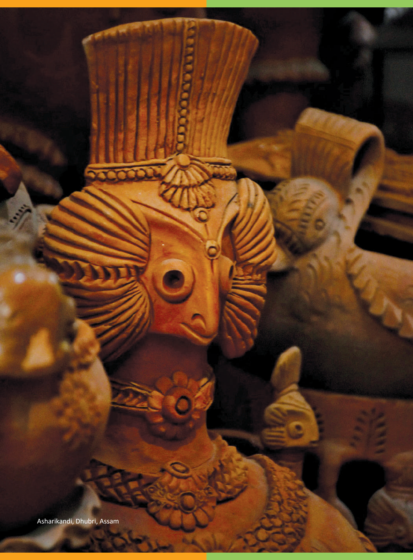
Asharikandi, Dhubri, Assam