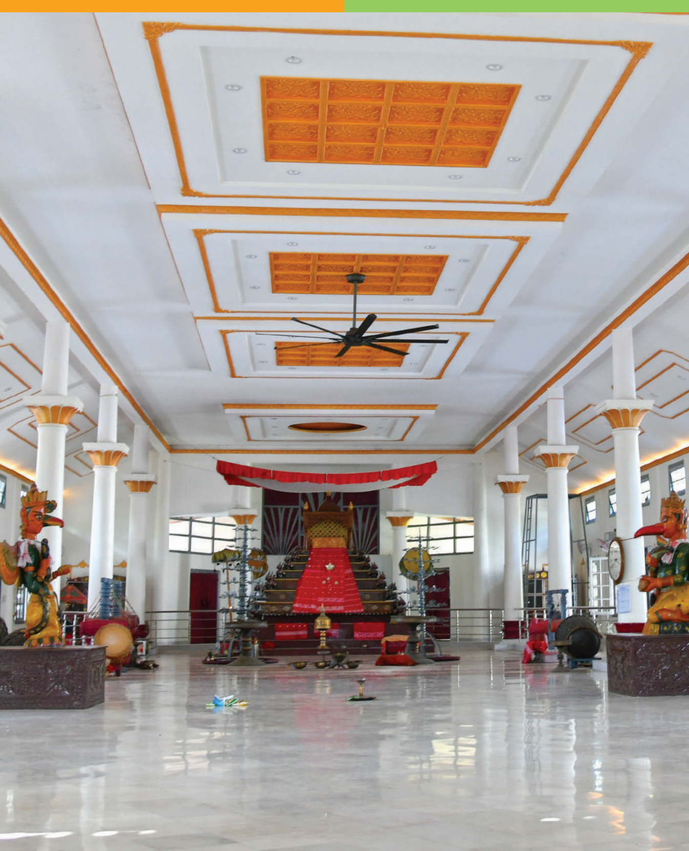
Borduwa Than, Borduwa, Assam