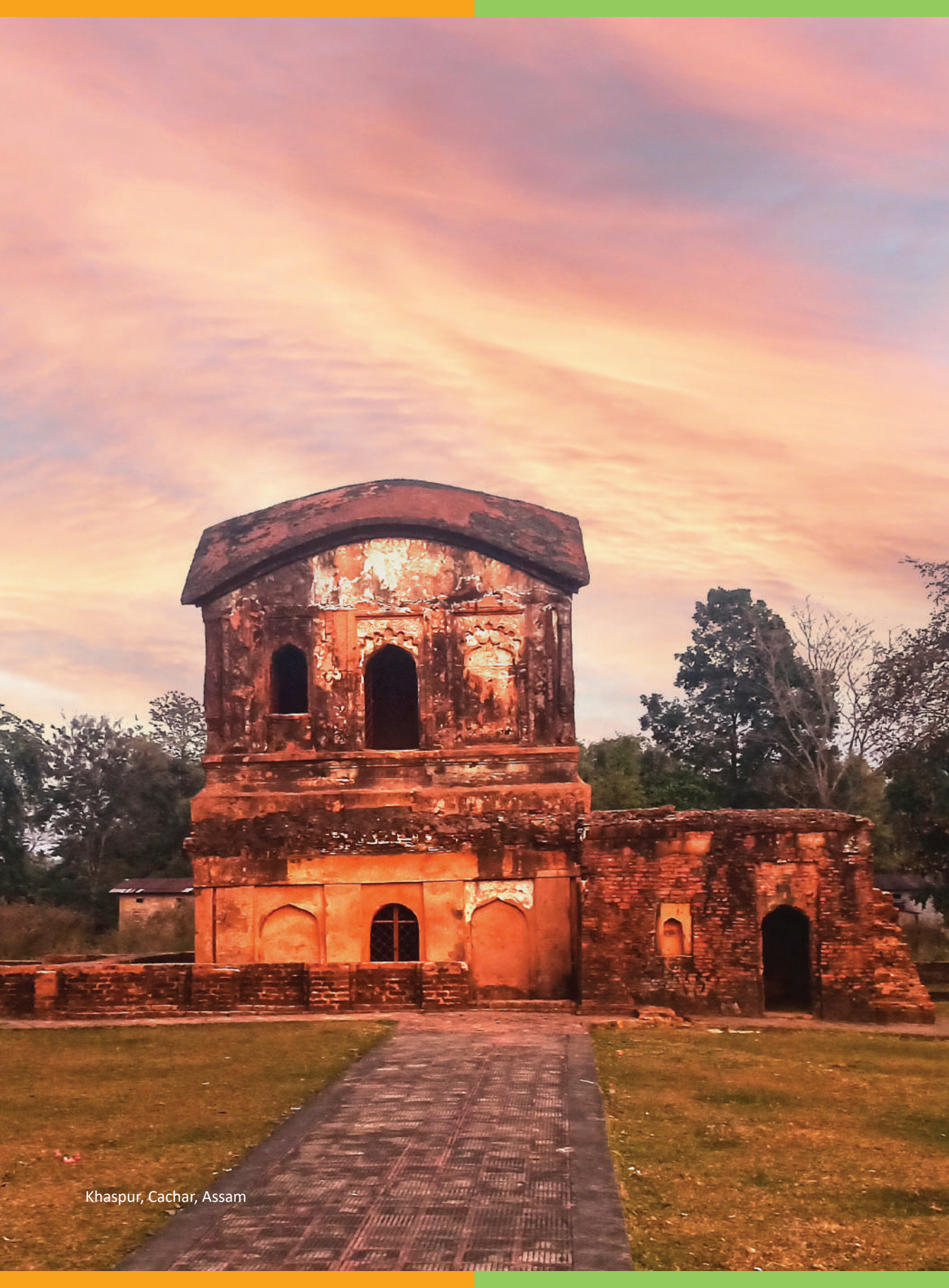
Khaspur, Cachar, Assam