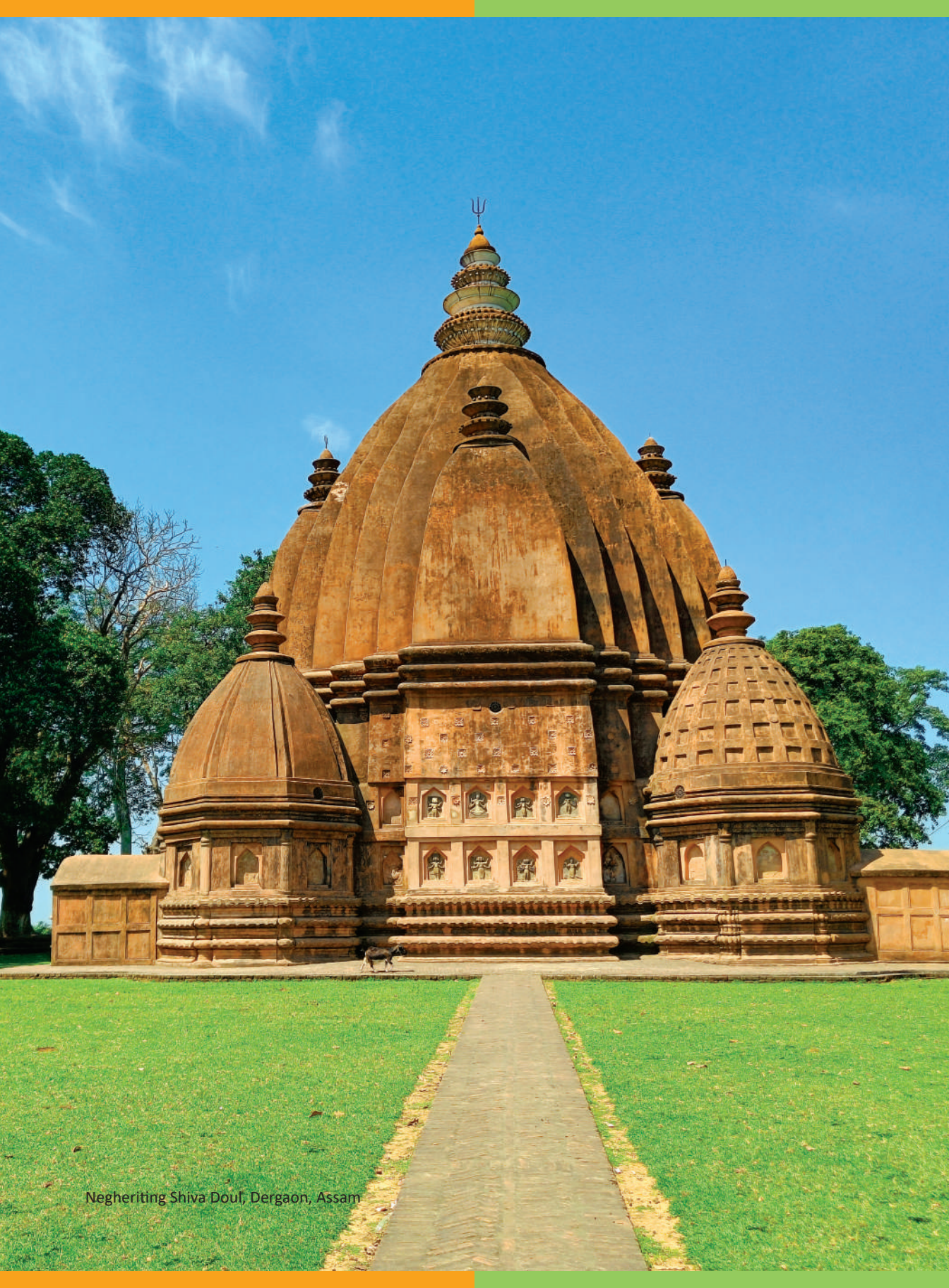
Nagheriting Shiva Douf, Dergaon, Assam