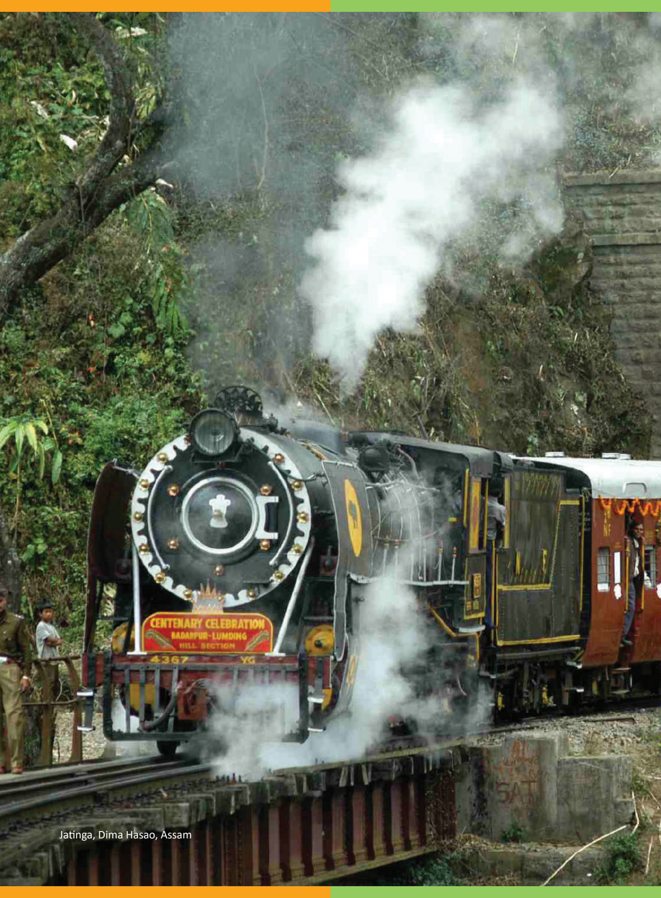
Jatinga, Dima Hasao, Assam