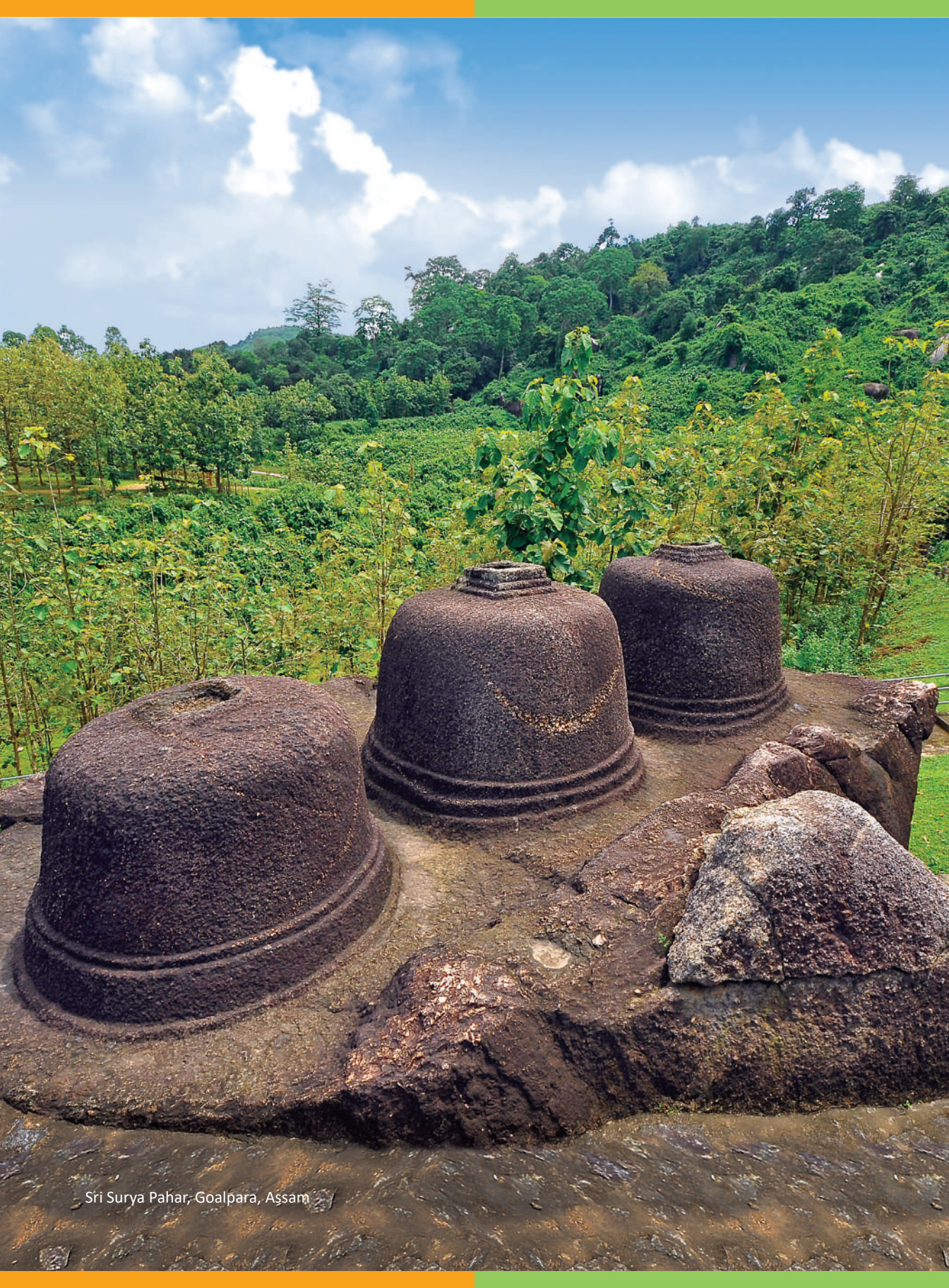
Sri Surya Pahar, Goalpara, Assam