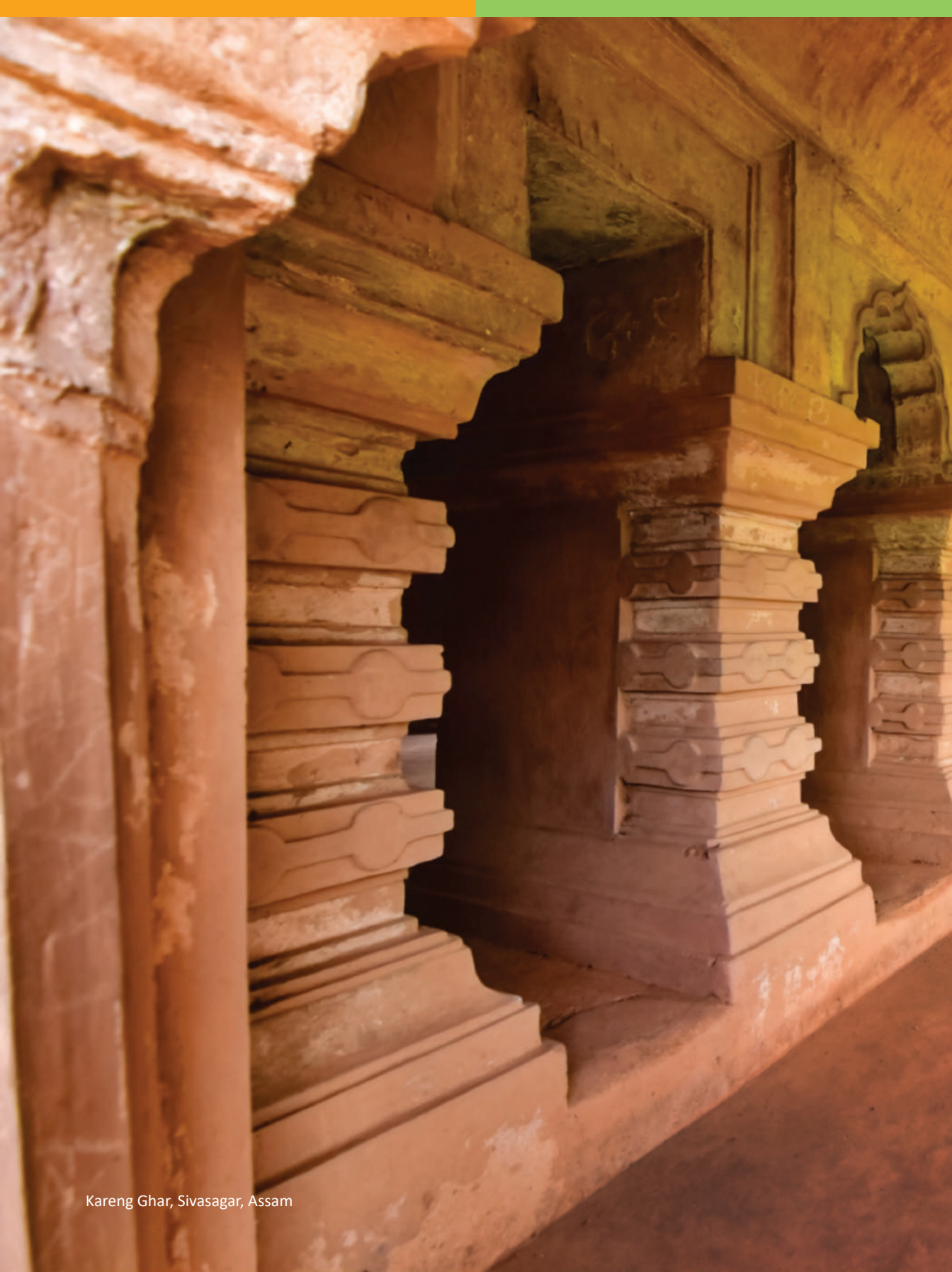
Kareng Ghar, Sivasagar, Assam