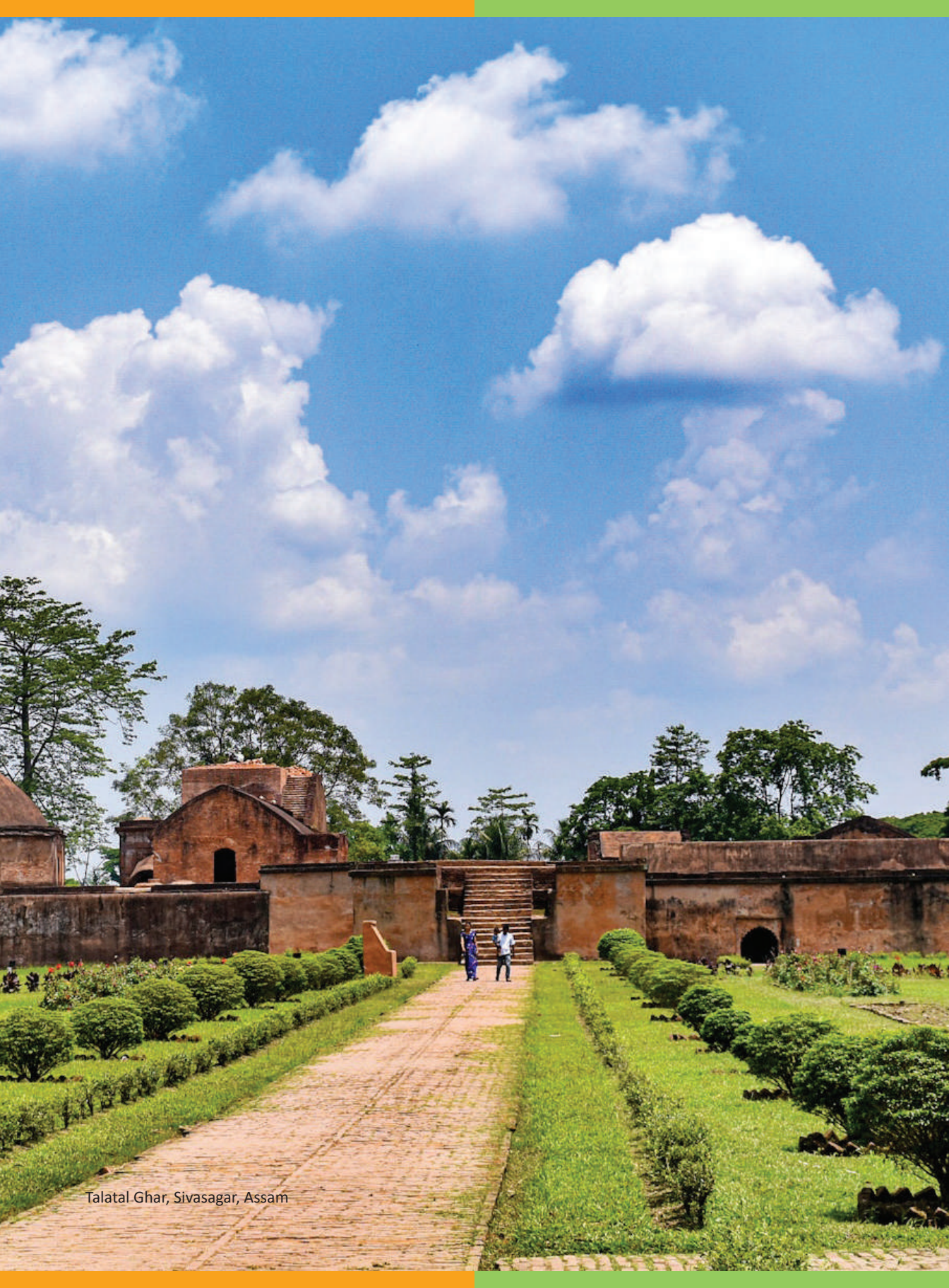
Talatal Ghar, Sivasagar, Assam