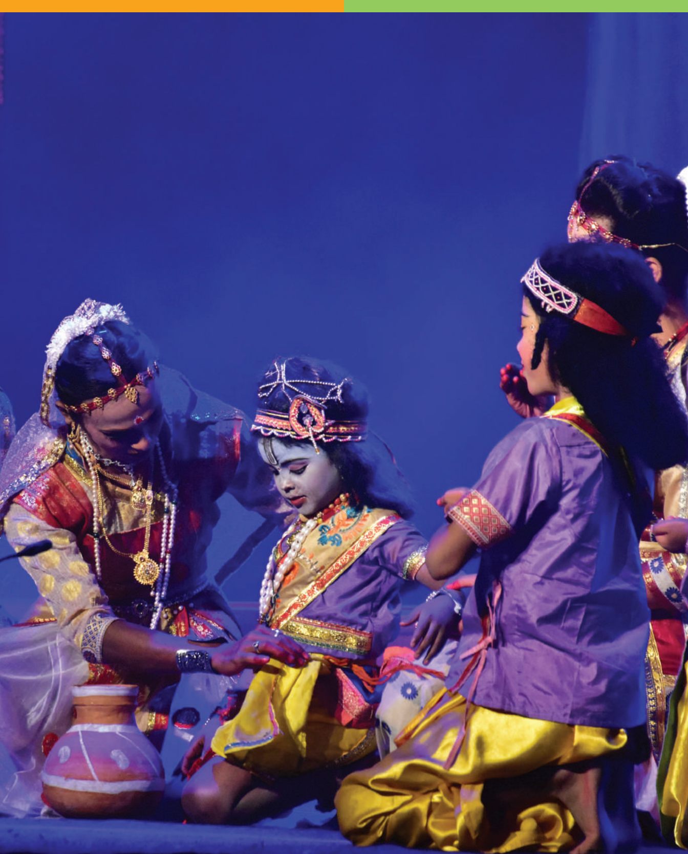
Rash Mahotsav at Majuli, Assam